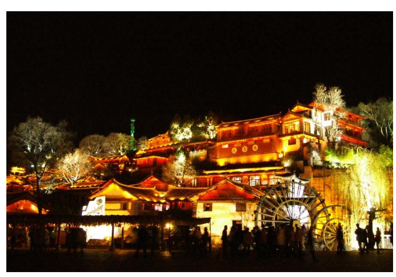
The night view of Lijiang town

All these natural sceneries and these cultural treasures of the minority peoples have been continuously drawing tourists from all over the world and have recently vote Lijiang as one of the favorite destinations in China