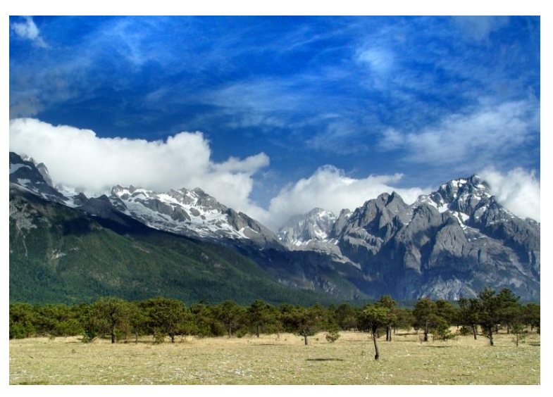
Jade Dragon Snow Mountain

The post-symposium tour covers the two-day sightseeing around Lijiang town, Jade Dragon Snow Mountain and Shangri-La