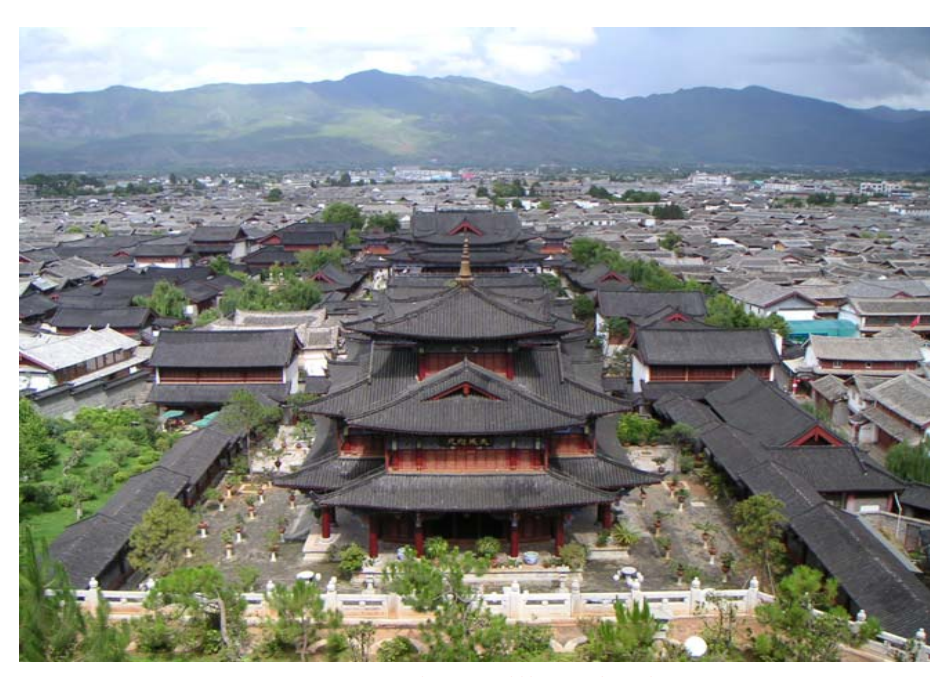
The Earthly Paradise—Lijiang Ancient Town

August 7-11, 2011 Lijiang, Yunnan, China